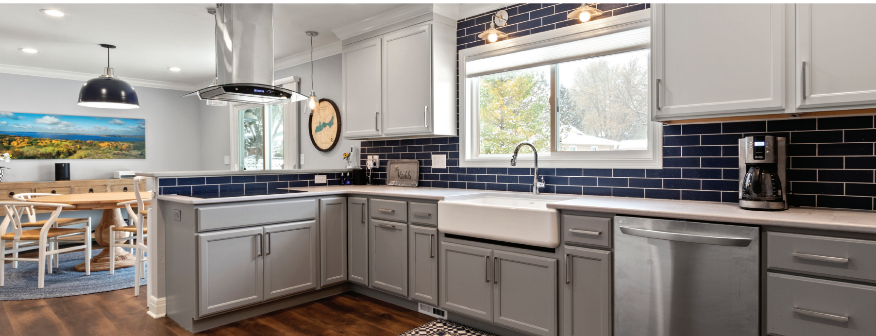
Lakehouse Renovation 1709 Fairview Drive Lake Geneva, WI 53147